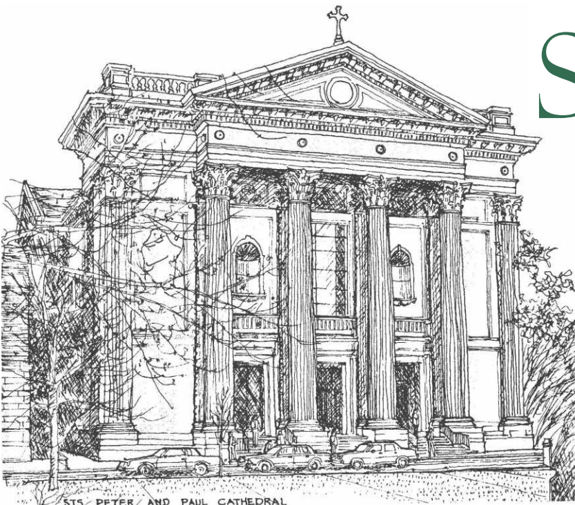
ST. PETER AND PAUL CATHEDRAL